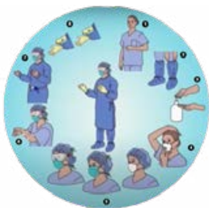
Diagram demonstrating sequence of Donning of PPE (Methods to wear PPE) Starting at diagram 1 and completing the method by diagram 8

Note - Staff working in Isolated OPD/Emergency room shouldn't go to regular OPD at any time, In case if, further consultation needed staffs should communicate over telephone or virtual communication. In case regular OPD staff needs to go in Isolated OPD full PPE must be worn. Bringing patient from Isolated OPD to regular OPD should not be allowed.