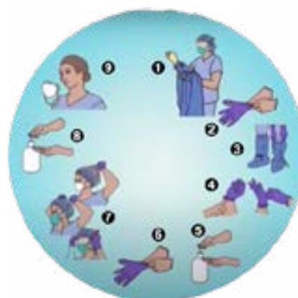
Diagram demonstrating sequence of Doffing of PPE (Methods to putting off PPE) Starting at diagram 1 and completing the method by diagram 9

https://www.youtube.com/watch?v=cCzwH7d4Ags